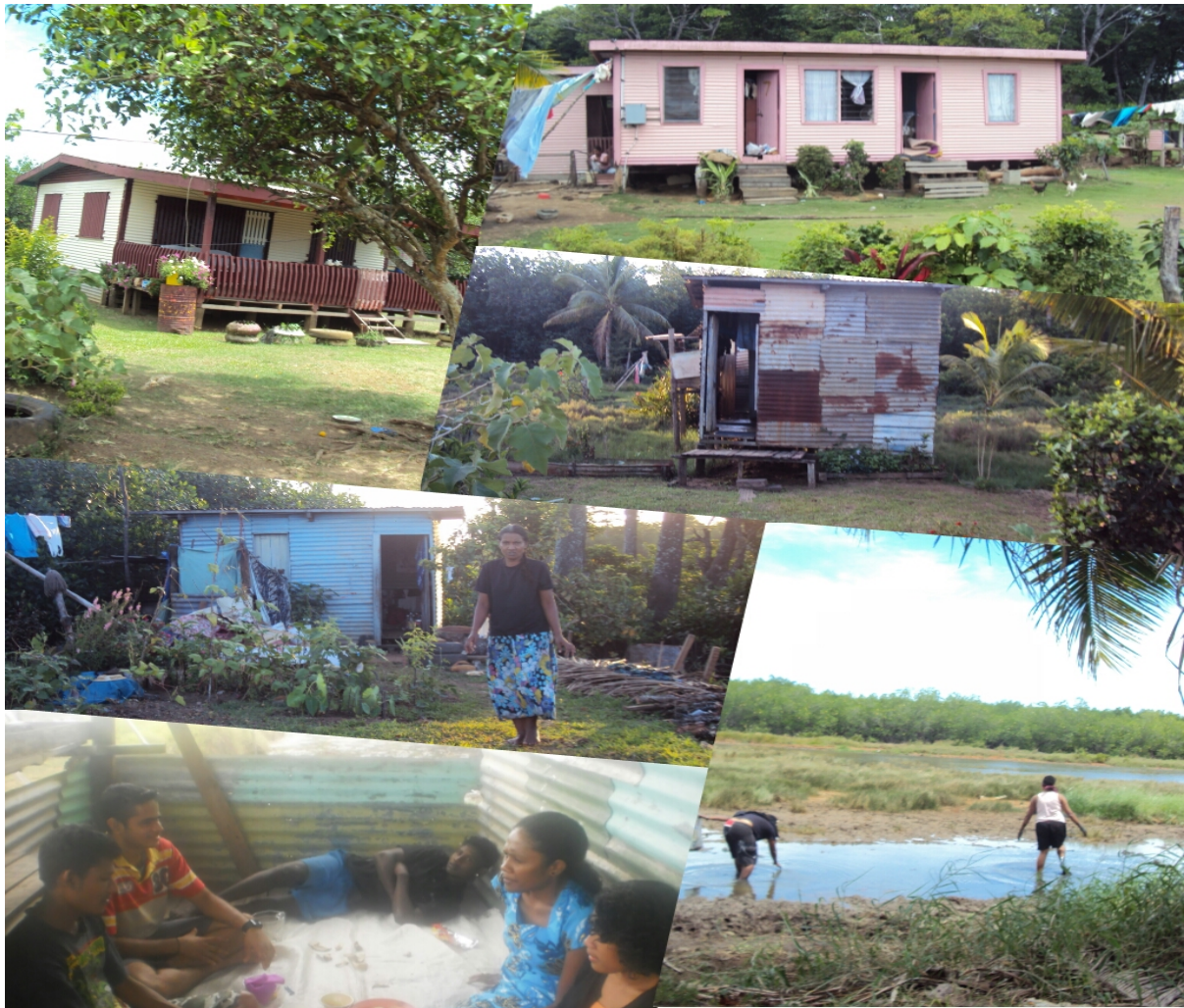
(Namara Tiri squatter settlement homes)