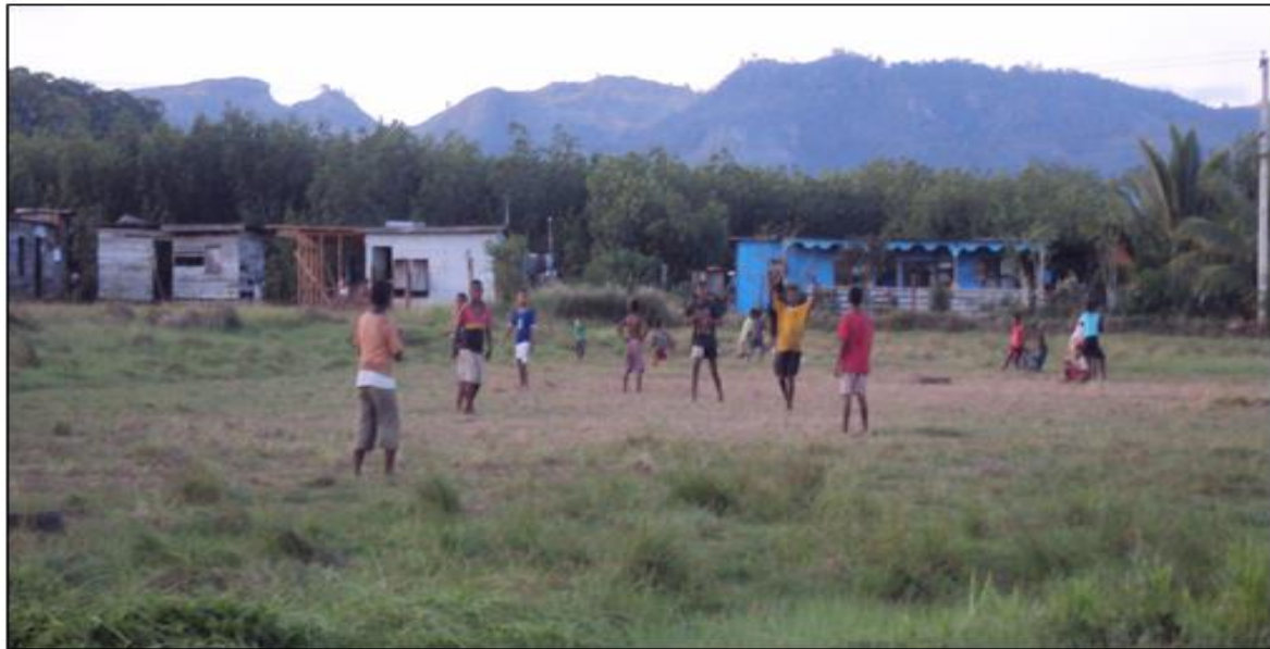
Figure 8: Children of Namara squatter settlement playing rugby after school

A youth from the settlement stated that “we have recently started an initiative whereby the older working children are levied fees of $2.00 every month to help pay for soccer balls, rugby balls and a goal post and better sporting facilities”. The President of the settlement association kept the money collected which was to be used to purchase sporting equipment for the children. The children also go swimming and fishing in the river. Those who had tin boats paddle these in the river. The smaller children roll old used tyres and also played marbles and “ gulli danda ”.