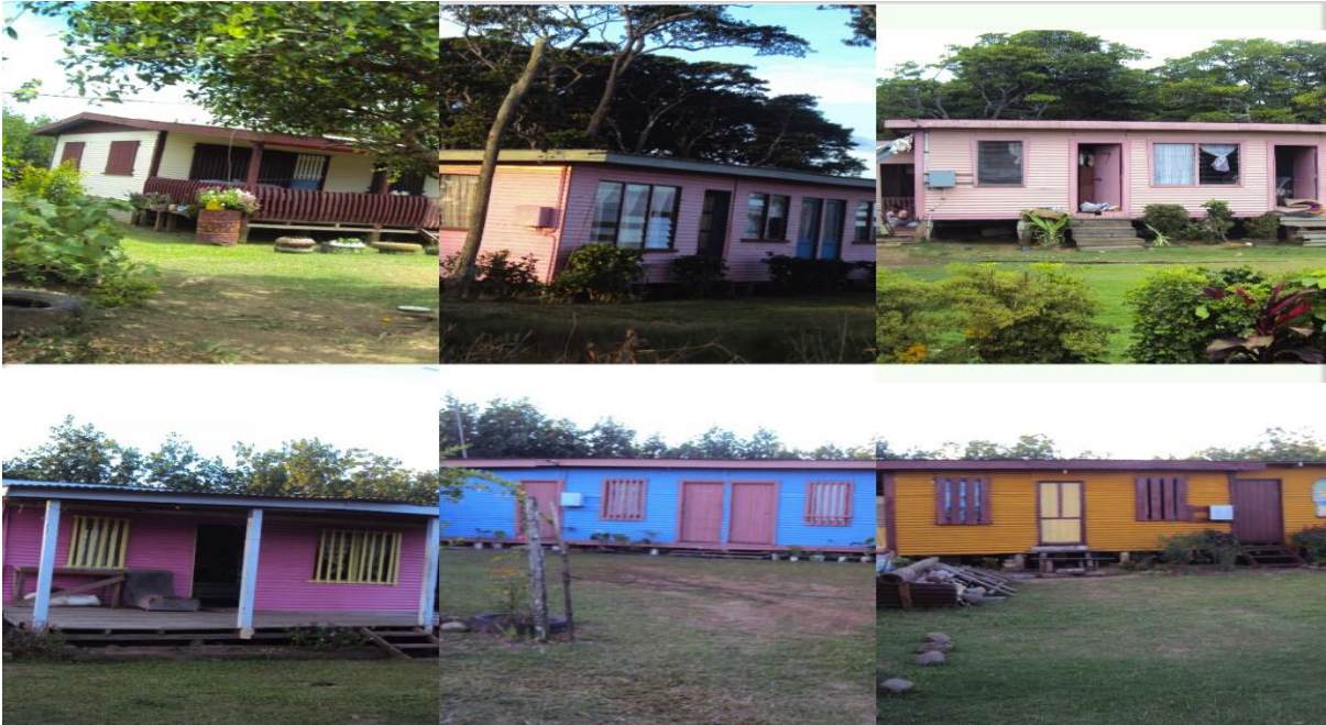
Figure 3: Better standard houses in Namara Tiri squatter settlement

The thirty houses that have 2 bedrooms are not that well-built and are homes of middle level income earners, while the remaining 31 homes that have one bedroom or no bedroom and are