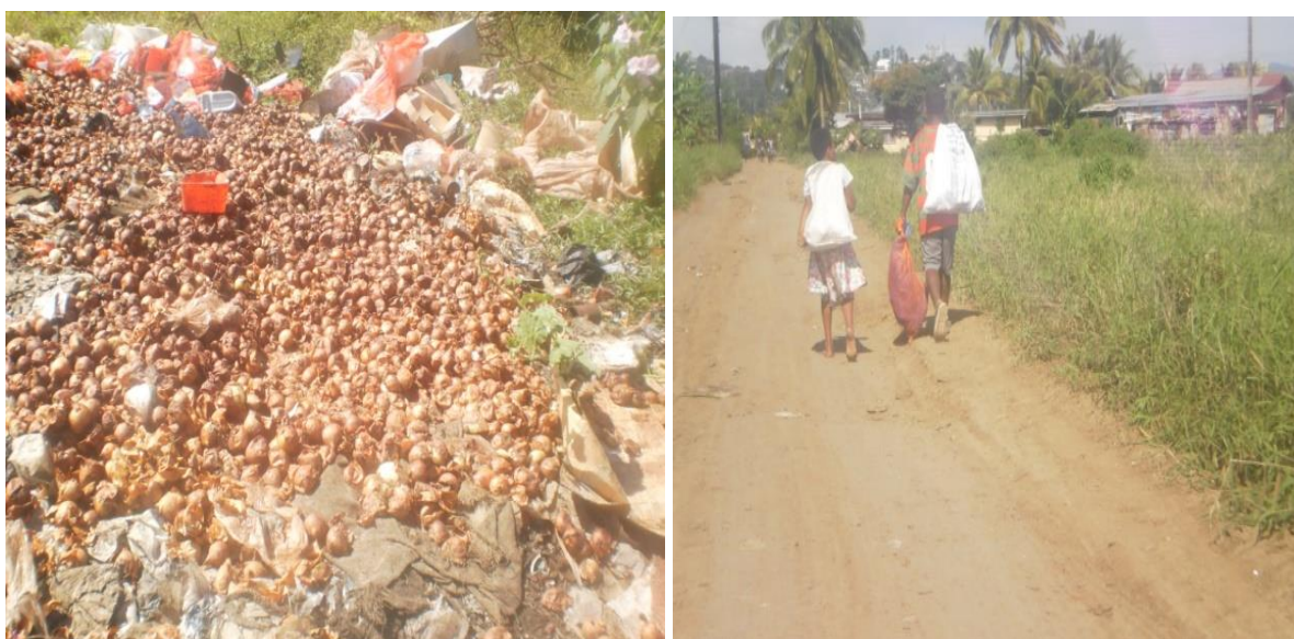
Figure 5: Pictures of Labasa Rubbish Dump with disposed supermarket onions and assortment of rubbish, and two scavengers returning to the settlement with their bags.

The proximity of the Labasa rubbish dump (an open dump) to the settlement is hazardous 28 to the people due to the unpleasant smell, the presence of flies and other pests, and also because a few poor families scavenge from the dump for food, scrap metal and cans to sell and support their families. For some really poor families, onions and potatoes disposed by supermarkets were collected from the dump, washed and dried and later used in meals (See Figure 5). According to families living close to the rubbish dump, it is busiest with scavengers when trucks from supermarkets dump food items not considered fit for human consumption. Observations showed that people from nearby houses, Namara village as well as those from other informal settlements (Siberia, Nakoroutari, and Vakamasuamasua Sub-division) further afield in Labasa came to collect disposed foodstuff and other items from the rubbish dump. Some cycled on their bicycles with big sacks to retrieve usable items such as potatoes and onions; canned products including tinned fish and meat; and, containers, plastic bags, and sacks.