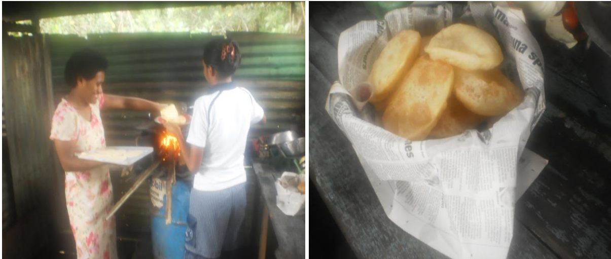
Figure 6: Namara resident cooking lunch using firewood

Dalomo timber mill was more affordable. A few families also bought firewood for $1 a bundle from nearby convenient stores. Preshila Prasad opined that, “the food is really tasty when cooked using the firewood when compared with food cooked on the kerosene stove, so most of us prefer cooking using open fire”. A majority of the families had easy built small open fire cooking sheds outside their houses.