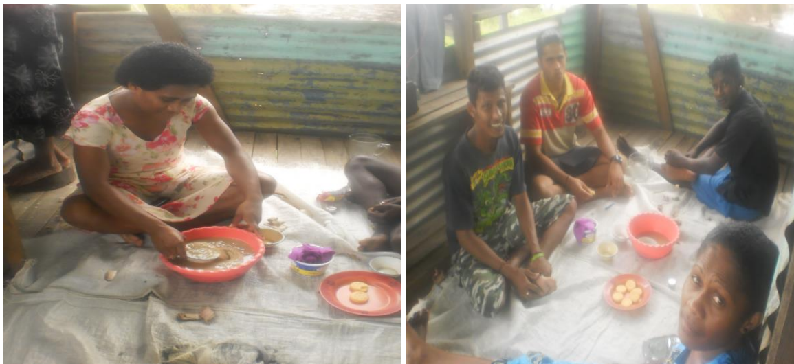
Figure 7: A family in Namara, enjoying the company of friends over a bowl of Kava.

Social life in the evenings for men in the settlement was over a basin of kava as evident by the grog pounding each evening along the only feeder road that links the settlement to the main road. Card games also provide an important past time. The availability of television in some houses served as an important source of entertainment. A female respondent indicated that 'we