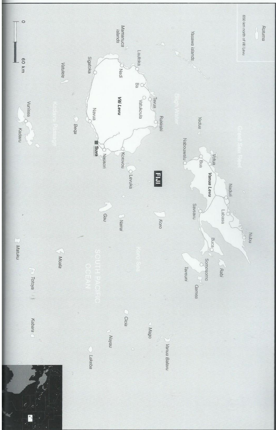
FIJI: THE CHALLENGES AND OPPORTUNITIES OF DIVERSITY