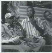
Indigenous Fijians and Indo-Fijians participate in a Citizens' Constitutional Forum community education workshop in the Ba province, Fiji.